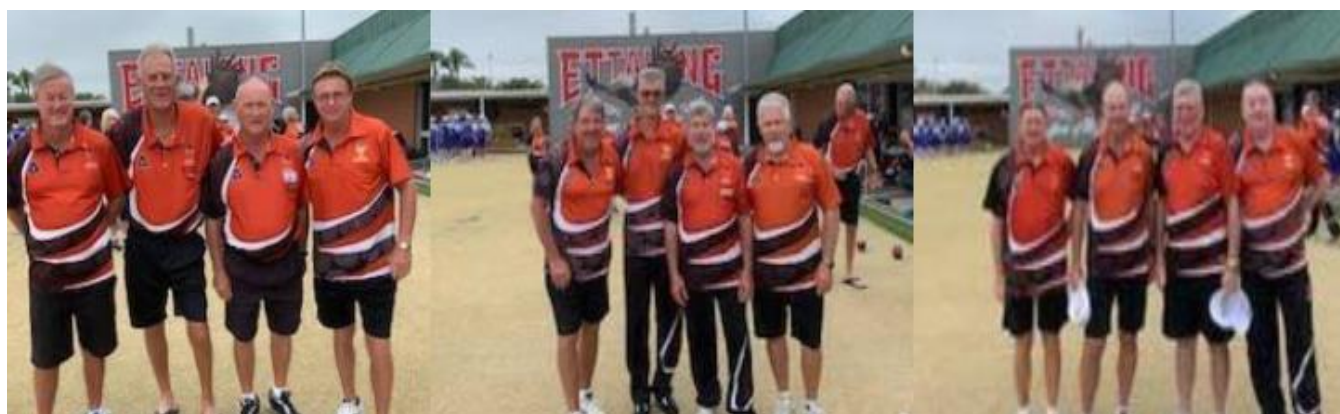
(d) Indicates debutant in 2019